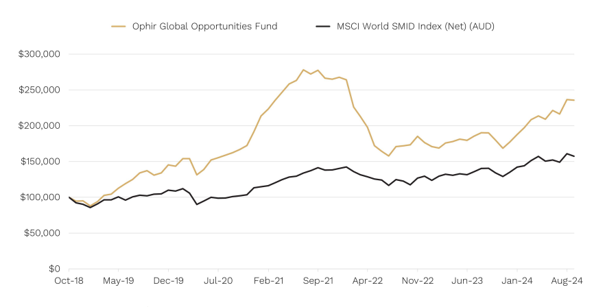
Chart represents net value of $100,000 invested since inception and assumes distributions reinvested. Please note past performance is not a reliable indicator of future performance.